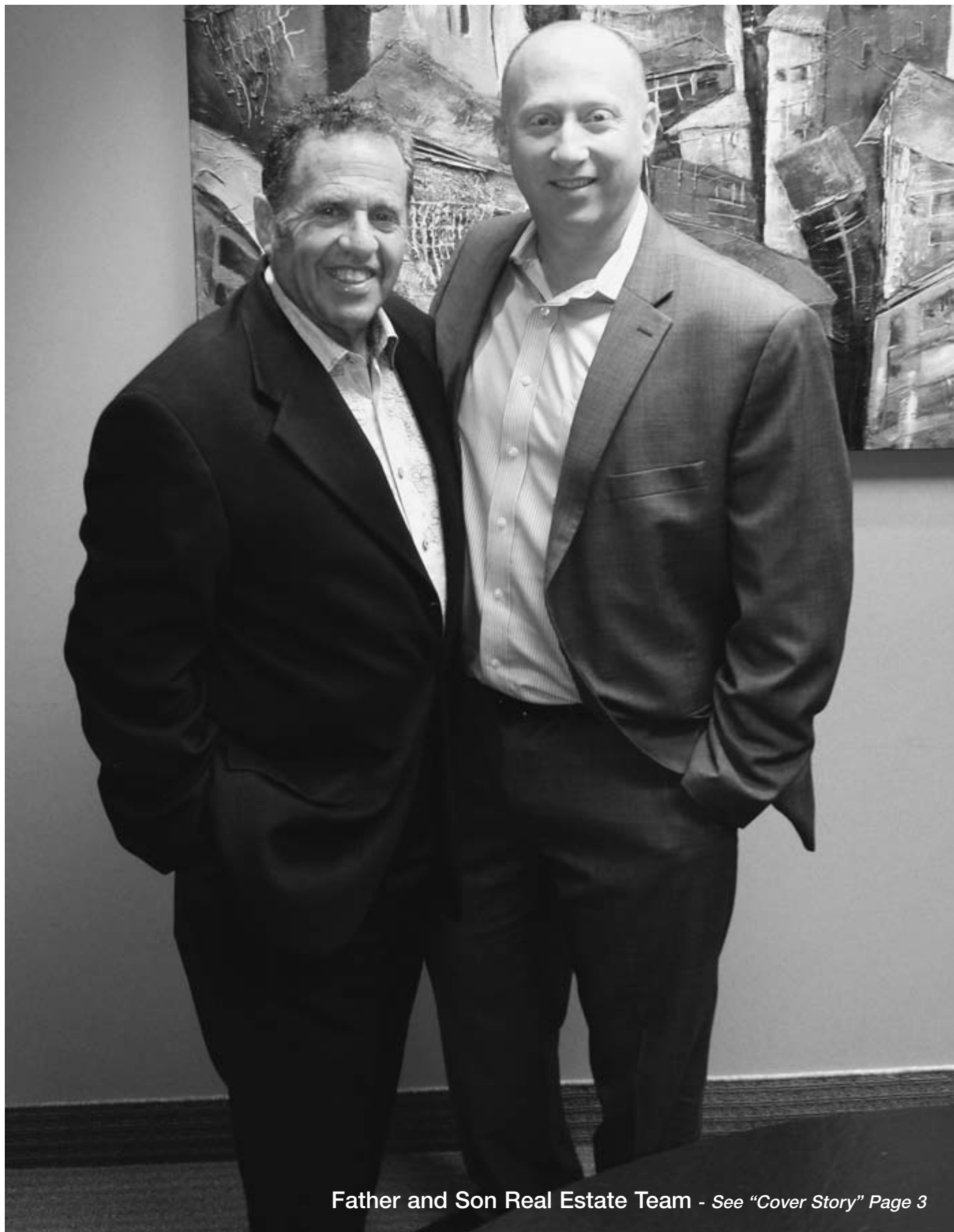
Father and Son Real Estate Team - See "Cover Story" Page 3